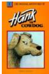
3 pt. (23,000 words)