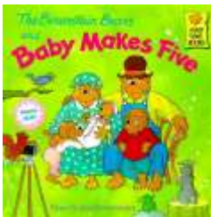
1 pt. (8,000 words)

Every book that has an AR Reading Practice Quiz is given a point value. AR points are computed based on the difficulty of the book (ATOS readability level) and the length of the book (number of words). For example, the Berenstain Bears books, which are about 8,000 words long and have an average reading level of 3.5, are 1-point books. Hank the Cowdog , which is about 23,000 words long and has an average reading level of 4.5, is a 3-point book. The Sun Also Rises , about 70,000 words long and at a reading level of 4.4, is a 10-point book.